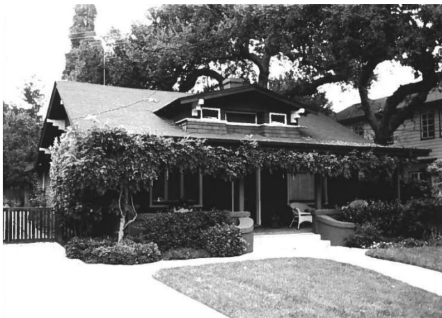
Figure 1: 1997-2001 Survey Update photograph.