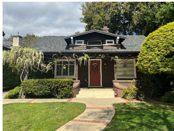
Figure 2: 2023 Reconnaissance Survey photograph.