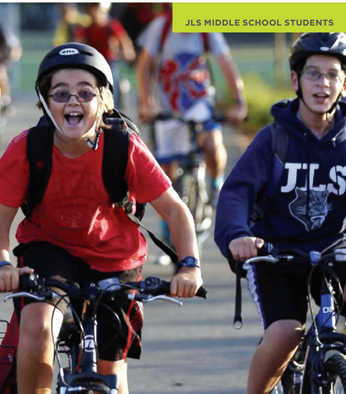
JLS MIDDLE SCHOOL STUDENTS