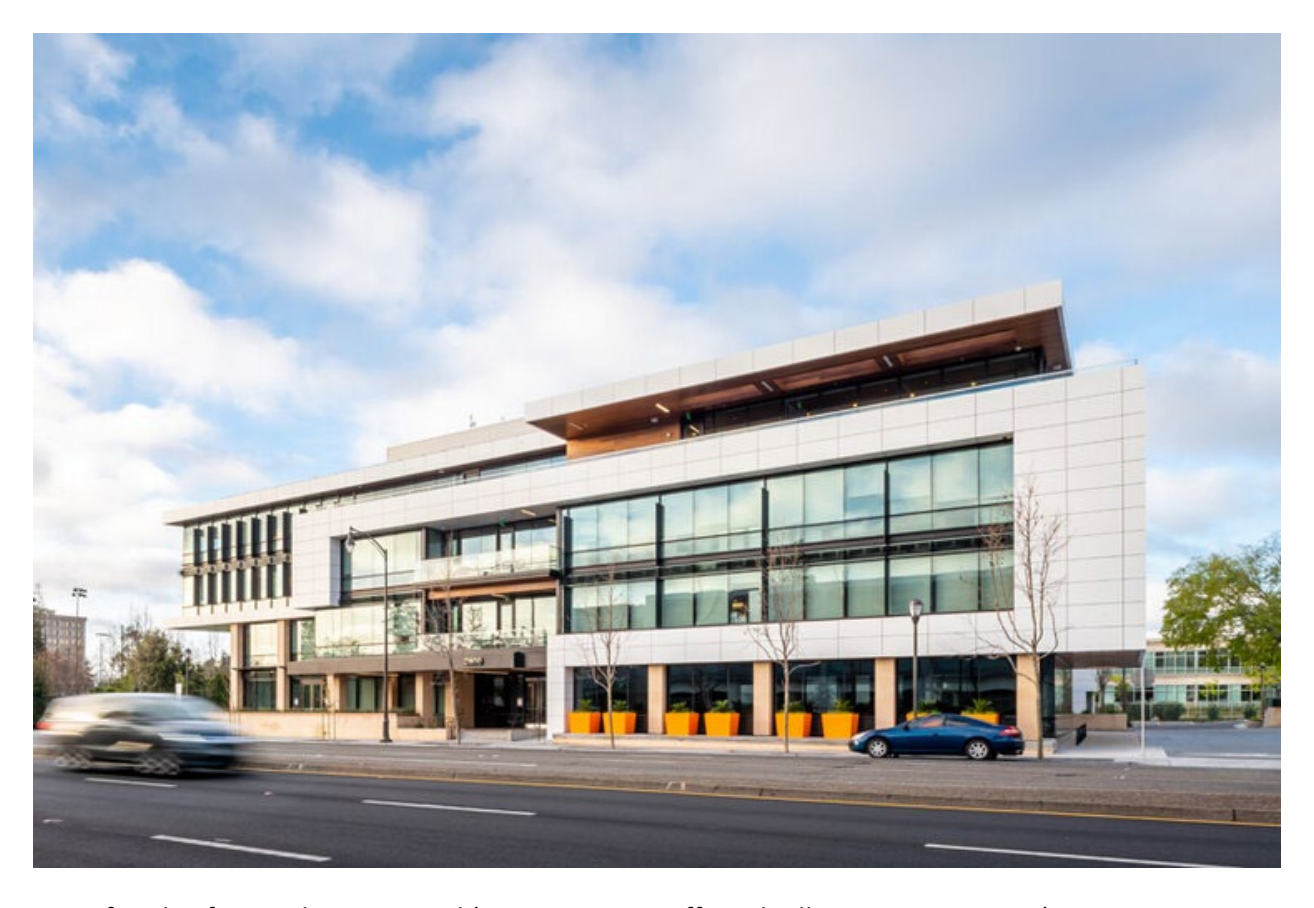
Front façade of 2600 El Camino Real

The amount of percent for art funding in the escrow account is $110,700, and the applicant will be spending above that amount to purchase and install the proposed sculpture.