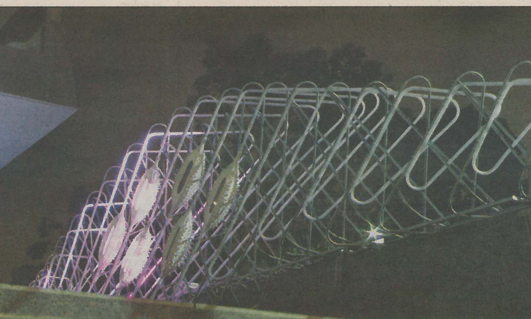
"Murmur Wall," seen here installed in San Francisco, pulls search results from within a half-mile radius.