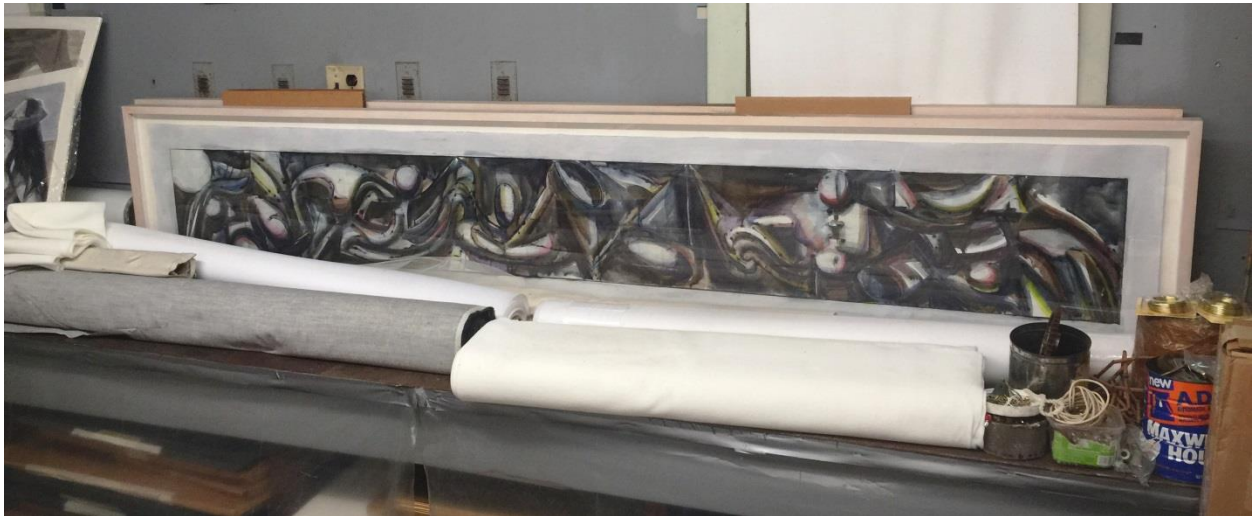
Images from top: No 1 Longscape and No 2 Longscape , 2003 by Joseph Zirker, cast acrylic monotype, 16"x95". The artworks were photographed in the artist's studio in Menlo Park. The two monotypes are offered for donation into the City collection by the artist's daughter Karen Jo Koonan.