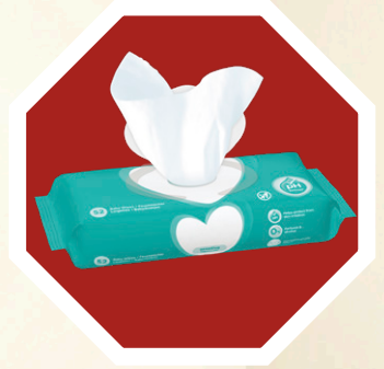
Wipes of Any Kind

...hair, contact lenses, cotton pads or swabs, diapers, medication, cat litter, toilet roll tubes, floss, cigarettes, cleaning chemicals, paints & pesticides; fats, oils, grease (FOG), razors, or anything else! Flushing items other than human waste and toilet paper causes sewer backups into homes and streets, and pollution into creeks and the San Francisco Bay.