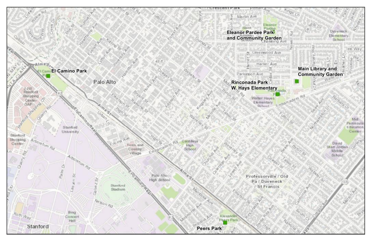
Figure 3: Parks Considered for Groundwater Irrigation

The five parks considered in this study (El Camino Park, Eleanor Pardee Park, Rinconada Park, Main Library, and Peers Park) are located east of El Camino Real and north of the Oregon Expressway as indicated on Figure 3. Although there is an emergency supply well located in each park, the wells are not currently used for irrigation. The park irrigation systems are connected by meters to the City's potable water system. The City's potable water system supplies the parks with an average supply pressure ranging between 60 and 65 pounds per square inch (psi). The pressure at Peers Park is boosted to 65 - 70 psi. The El Camino well is directly plumbed to a 2.5 MG reservoir, not tied into the distribution system, with booster pumps pumping reservoir water into the distribution system after filled.