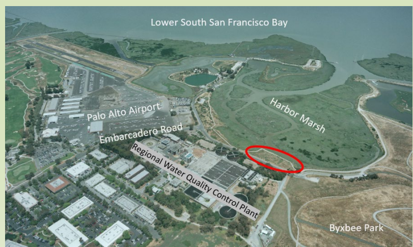
FIGURE 3: Project location (red)

Samantha Engelage, Senior Engineer Samantha.Engelage@cityofpaloalto.org