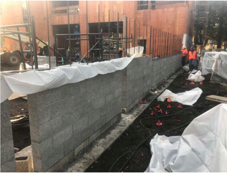
CMU wall block install.