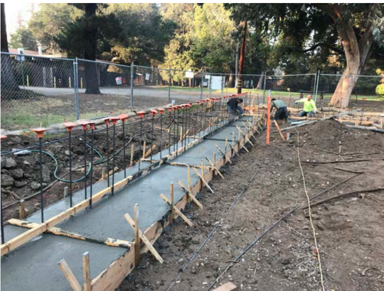
CMU wall foundation pour.