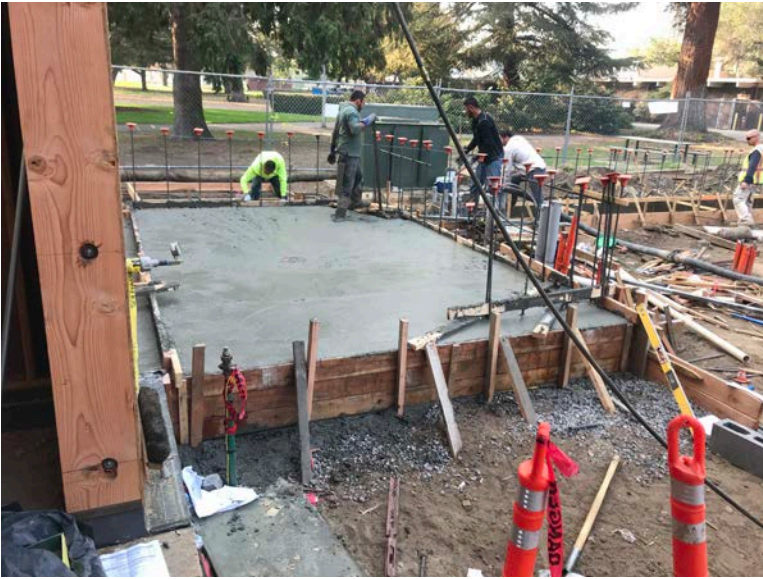
Trash enclosure slab pour.