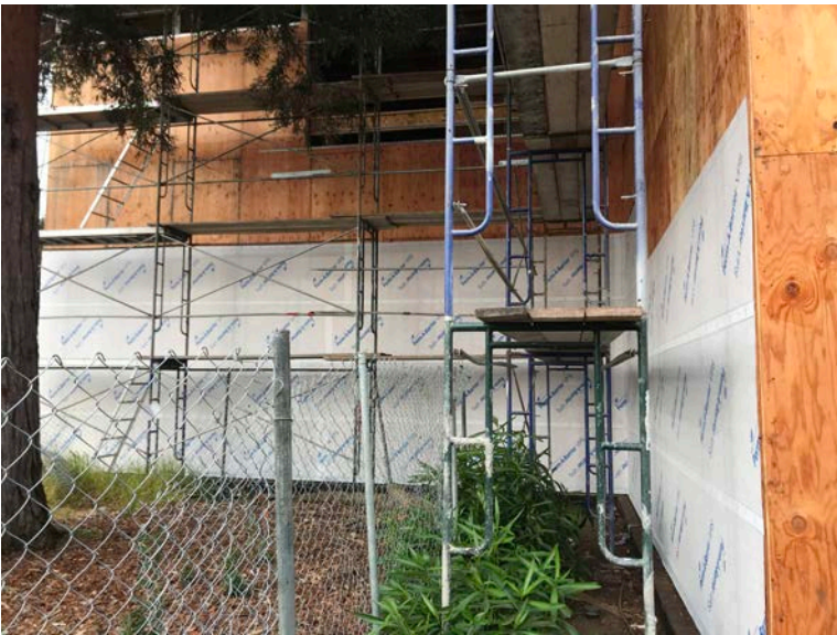
Building envelope waterproofing install.