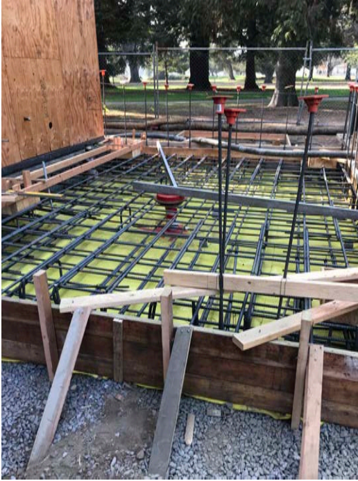
Trash enclosure slab prepped for pour.