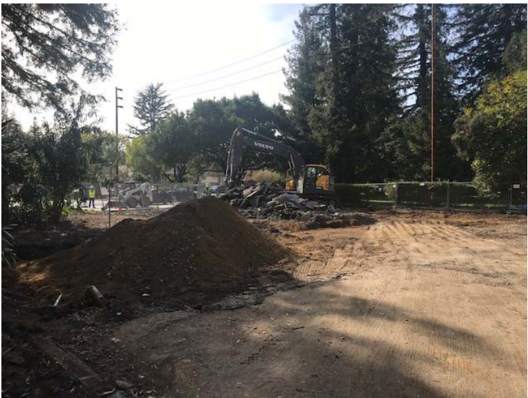
Existing structure demo completed.