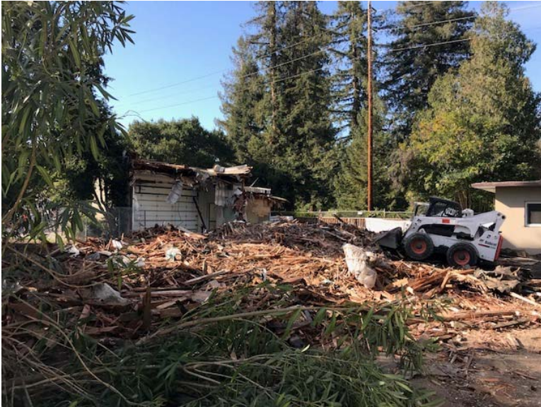
Demolition of existing structure.