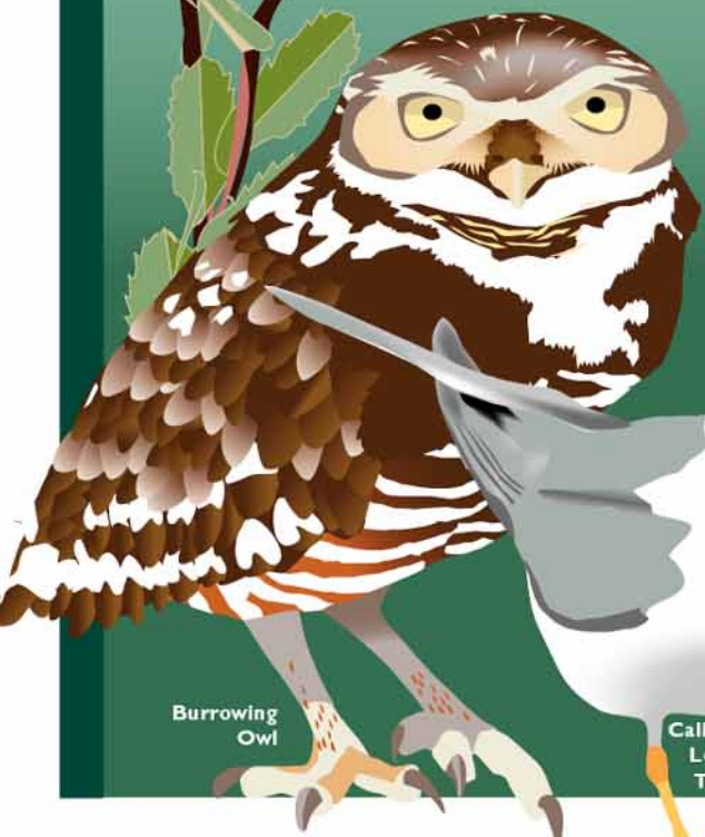
California Least Tern