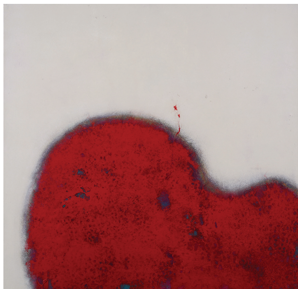
Crossed a Line, 40 x 40", handmade paper and acrylic on canvas