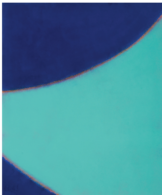
Expansion, 48 x 40", acrylic on canvas