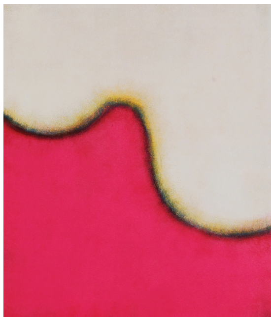
Detail shot of In My Secret Life, acrylic on canvas