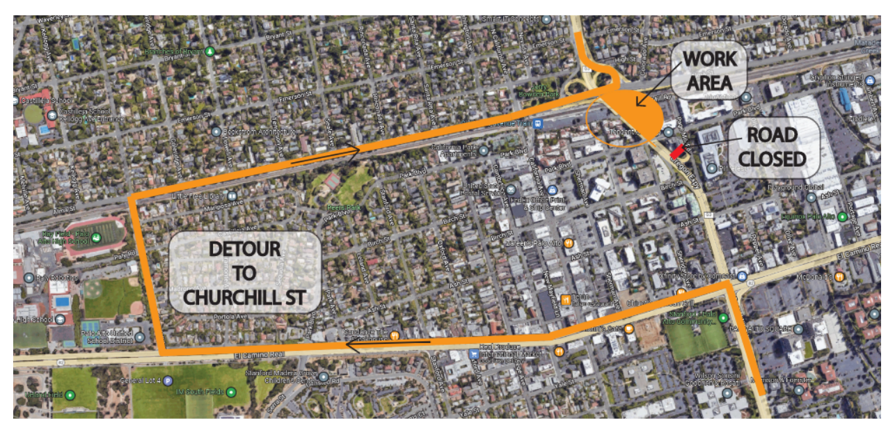
OREGON EXPRESSWAY - NORTHBOUND MONDAY DECEMBER 5th - FRIDAY DECEMBER 9th

On the night of December 05, 2022, there will be a closure of the two northbound lanes of Oregon Expressway. A detour will redirect northbound traffic to Churchill Ave. Southbound traffic will continue on Oregon Expressway.