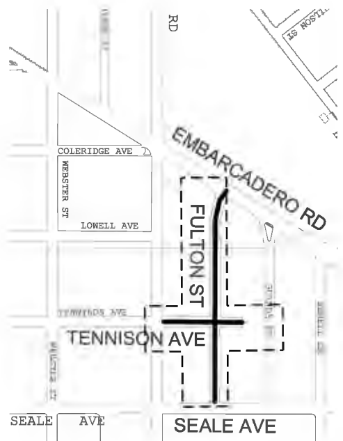
Area II FULTON/TENNYSON