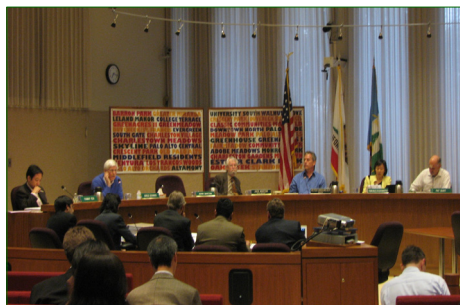
CITY COUNCIL MEETINGS