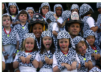
FIRE FIGHTERS SCHOOL PROGRAMS