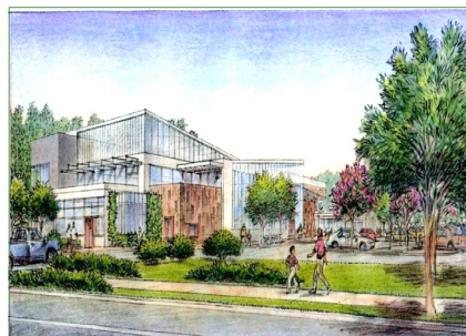
PROPOSED LIBRARY-COMMUNITY CTR