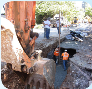
New storm drain pipes along Channing Avenue reduce street flooding along this important vehicle and bike corridor.

The Storm Water Management Program funds routine storm water system maintenance that keeps the system clean and at peak performance. It also funds construction projects that improve Palo Alto’s storm water system to prevent street flooding. Services also include litter reduction, urban pollution prevention programs, commercial and residential rebates, and flooding emergency-response services. Some of these services are state-mandated.