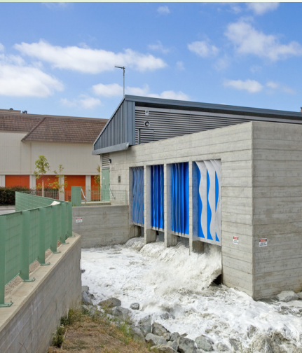
The San Francisquito Creek Storm Water Pump Station funded by the Storm Water Management Program clears water from a 1,250 acre neighborhood in Palo Alto.

The Storm Water Management Program funds routine storm water system maintenance and operations that keep the system clean and at peak performance, and storm water system improvements that prevent street flooding. The Program also provides litter reduction, urban pollution prevention programs, commercial and residential rebates, and flooding emergency-response services.