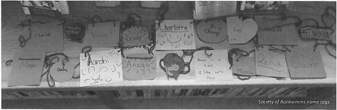
Society of Bookworms name tags.