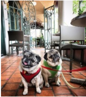
Minnie & Max Pugs @MinnieMaxPugs April 22

Dining al fresco in @cityofpaloalto! @ilfornaionline #puglife