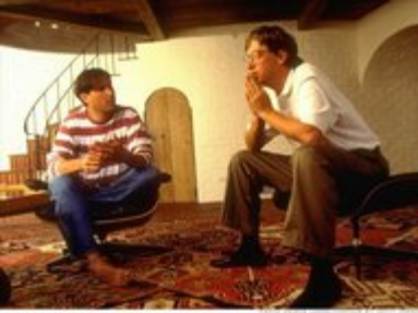
April 11

Steve Jobs and Bill Gates discuss the PC's future. Jobs' Palo Alto home, 1991.