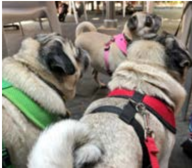
Minnie & Max Pugs @MinnieMaxPugs Sept. 16

#PaloAlto downtown library- after hours 3D printing /cc @cityofpaloalto