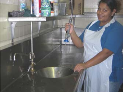
A water conserving pre-rinse sprayer replaced an old one