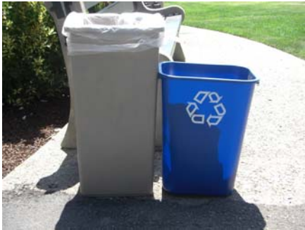
Recycling bins are conveniently placed next to garbage cans