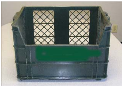
Recycling Crate (dark green plastic) 18”w x 12”h x 15”d Good for the kitchen/break room.