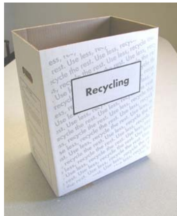
Deskside Recycling Box (cardboard) 13”w x 16”h x 9”d Good for under the desk.