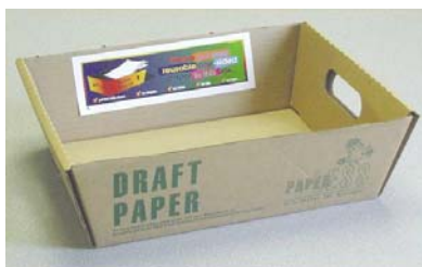
Used/Draft Paper Tray (cardboard) 11”w x 4”h x 11”d Good next to copiers and printers. Paper used on one side can be reused for draft copies or scratch paper.