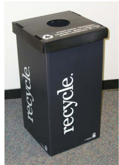
Recycling Bin (black corrugated plastic) 16”w x 16”d x 30”h Good for central areas.